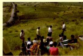
Students of JAU attended the training on Gir Forest of Dhari

Two days training on "Land Landscape Ecology of Greater Gir