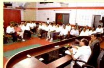
Brain storming session on preparation for VGGAS-2013