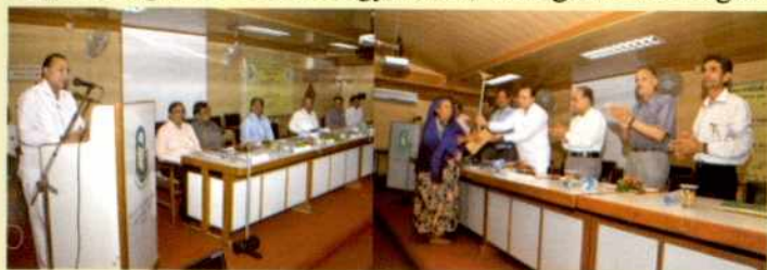
Inaugural address and Sprinkler set distribution TSP Farmers by Shri Babubhai Bokhiriya, Hon'ble Minister of Agriculture, Gujarat Govt., Gandhinagar

Under All India Coordinated Research Project on Ground Water Utilization, training for the tribal farmers on Sprinkler Irrigation System was organized by Department of Soil and Water Engineering, College of Agricultural Engineering and Technology, JAU, Junagadh on August