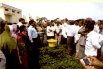
Celebration of Technology week at KVKS, JAU