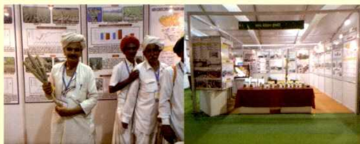
Cheerful faces of farmers during visit of Exhibition stall of JAU

event, seminar on various themes related to agriculture and animal husbandry were organized, in which scientists of JAU delivered the lectures.