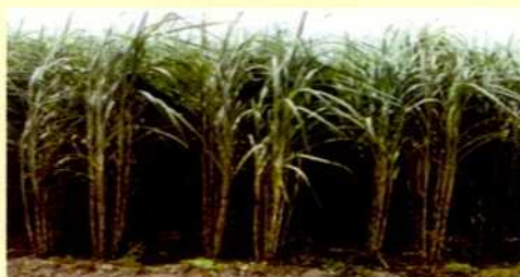
Sugarcane: Gujarat Sugarcane-5 (GS-5)

Besides that, 44 and 15 recommendations were made for the farmers and scientific communities respectively. Total 112 new technical programmes were also put up by the scientists.