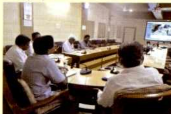
Hon'ble VC, JAU interaction through video conference