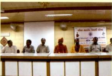
Celebration of 150 th Birth Anniversary of Swami Vivekanand at JAU, Junagadh

As a part of celebration of 150 th Birth Anniversary of Shri Swami Vivekanand in the country, a closing ceremony of the message procession (Sandesh Yatra) was arranged at JAU, Junagadh on September 21, 2013. Large number of students and faculty members of the university had taken part in this procession.