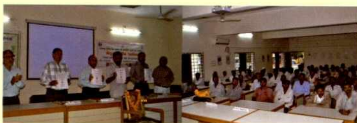
Inaugural function and farmer trainees of training programme

Two days farmers' training programme on "Export Oriented Spices Cultivation & its Value Addition" was organized at Millet Research Station (JAU), Jamnagar during September 26-27, 2013 with the aim to create