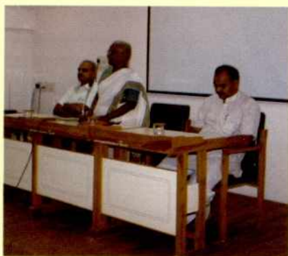
Professor Meet-Chintan Shibir at PGIABM, JAU, Junagadh