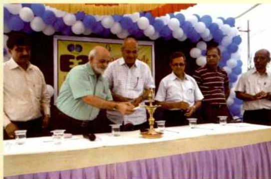
Inauguration of Seafood Trade Fair - 2013 at College of Fisheries, JAU, Veraval

Seafood Trade Fair-2013 was celebrated under ELP programme by 7 th semester students of B.F.Sc. and Department of Harvest & Post Harvest Technology. The seafood trade fair was organized on October 1, 2013 at