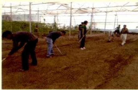
Practical in ITI

The first agro based ITI Course recently completed at JAU, Junagadh. During valedictory function, Dr AM