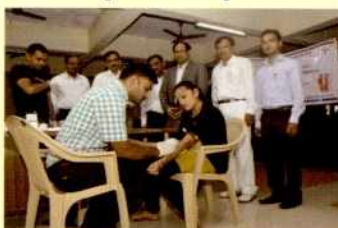
Thalassemia Screening and Blood Grouping of 582 students of JAU