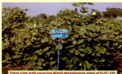
Plant view with squaring & boll development stage of GJC-101

The medium maturing variety Gujarat Junagadh Cotton - 101 (GJC - 101) released for general cultivation for the farmers of non-Bt cotton ( Gossypium hirsutum ) growing areas of Gujarat state under irrigated condition. The variety yielded seed cotton and lint 2107 kg/ha