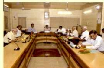
Meeting of Board of Management, JAU